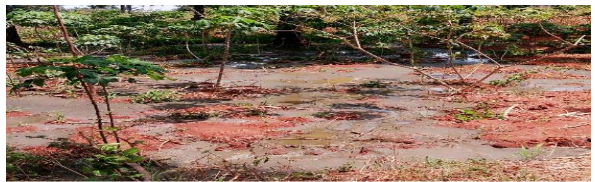
Figure 2: Farmland irrigated with sewage (Field study)

Evaluation of Microbial loads, parasites and Antinutrient factors in Talinum triangular grown on